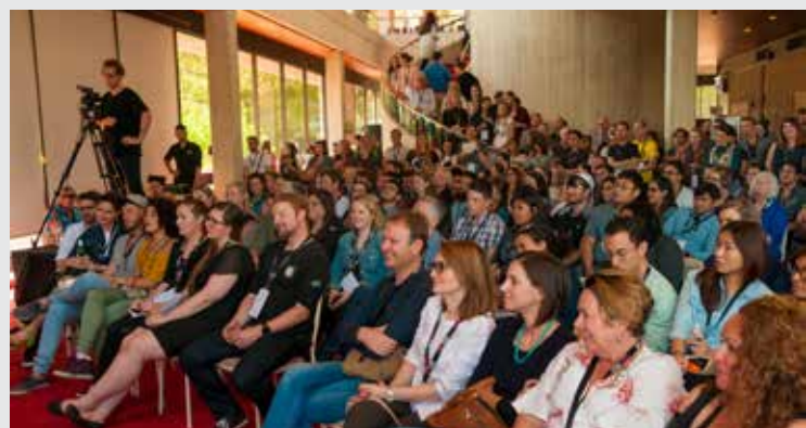
12 Q&A break outs