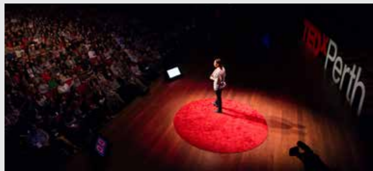
16 remarkable speakers