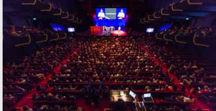
More than 1,500 engaged audience